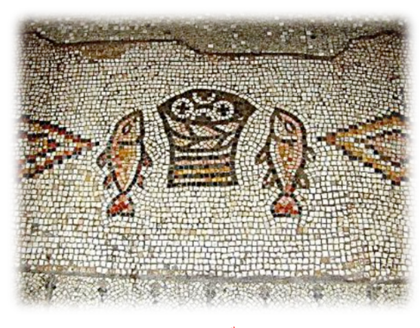
Mosaic Loaves and Fishes from 4<sup>th</sup> century Byzantine Church